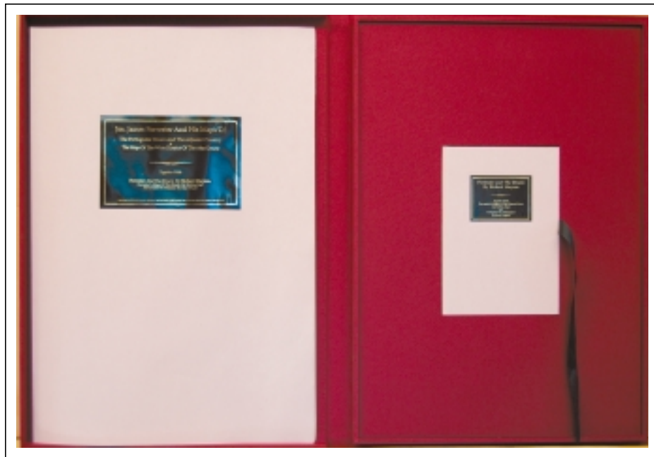
The map wrapper moved aside to show the text volume in its recessed panel.