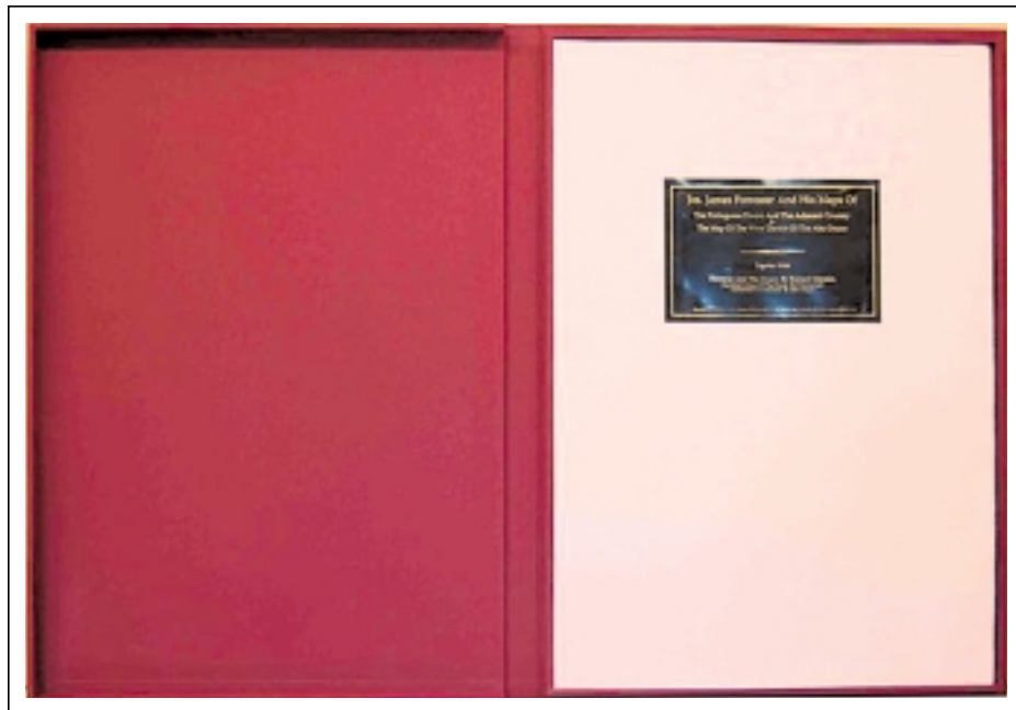
Open clamshell box showing the map wrapper, and gold foil stamped label.